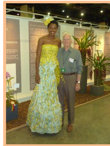
Dresses decorated with live orchids